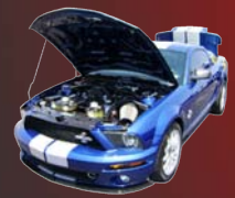
SPIRIT OF BILL JONES